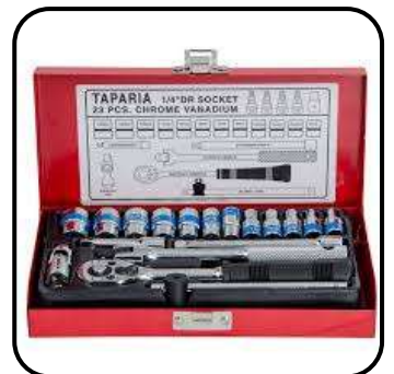
Drive Socket Set