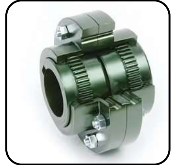
Lovejoy Gear Coupling