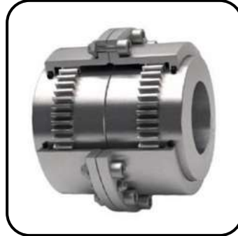
Rexnord Lifelign Gear Couplings