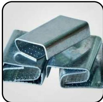
Steel Strapping Seal Locks