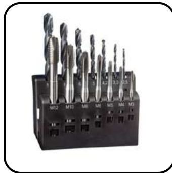
Drill & Tap Set