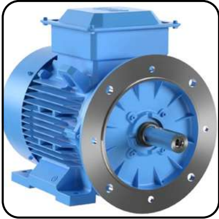
Electric Motor ABB