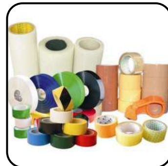
BOPP Colourfull Tape