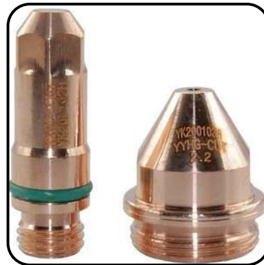
Plasma Cutting Electrodes & Nozzles