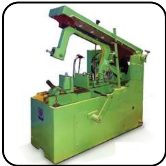
Hydraulic Hacksaw Machine