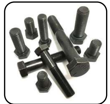
High Tensile Fasteners