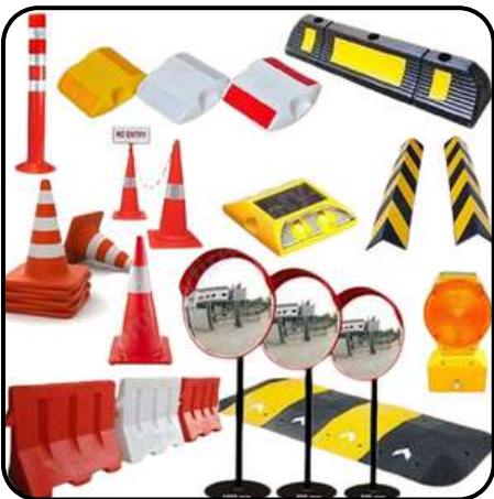
Road Safety Equipment