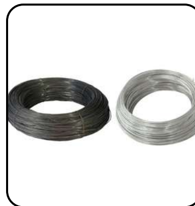
MS Wire & GI Wire