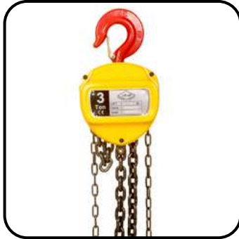
Chain Pulley Block