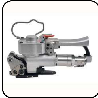
Automatic Strapping Machine