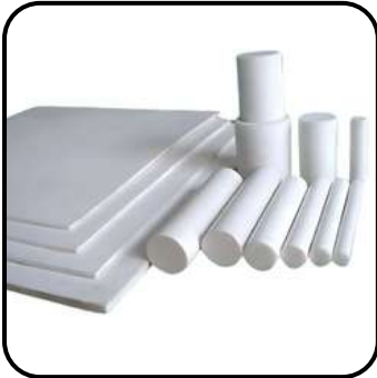
Teflon Sheet and Rod