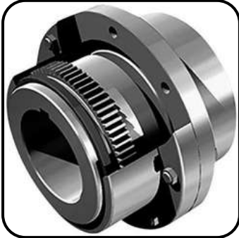
Cast Iron Gear Coupling