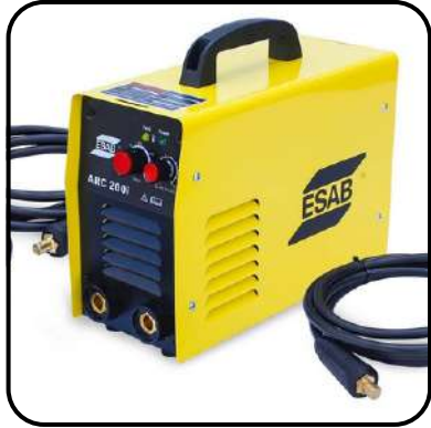
Welding Machine & Spares