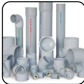
PVC Pipe & Fittings