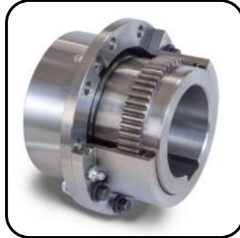
Fenner Gear Coupling