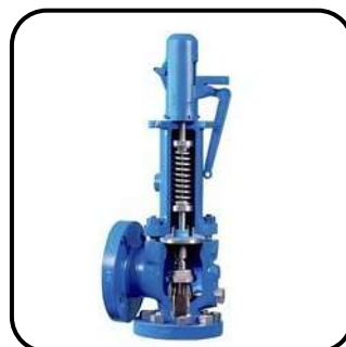
Pressure Relief Valve