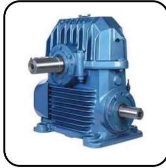
Premium Gear Box