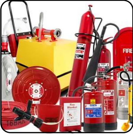
Fire Fighting Equipment