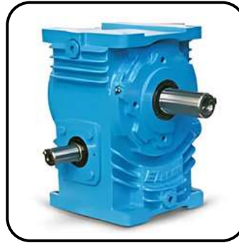
Elecon Gear Box