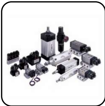
Pneumatic Cylinder and Valve