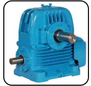
Shanthi Gear Box