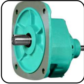
Radicon Powerbuild Gear Box