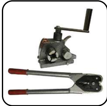
Manual Strapping Machine